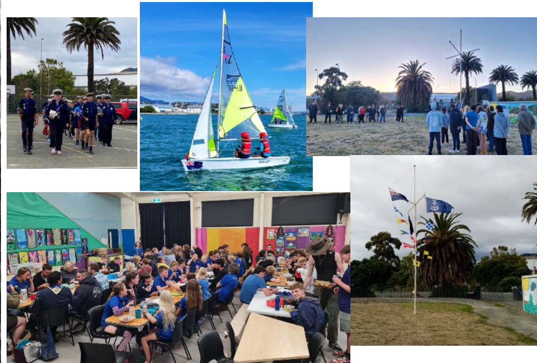
School Holiday Activities