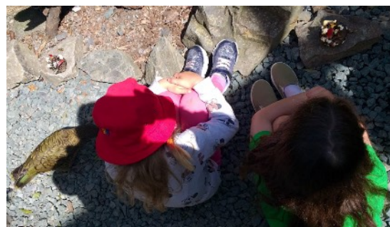
So Close to Kea!